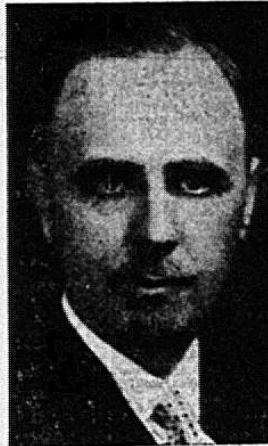
Dwight James Baum Monument architect